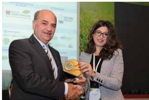
HE MR. ARTHUR NAZARIAN MINISTER OF ENERGY & WATER