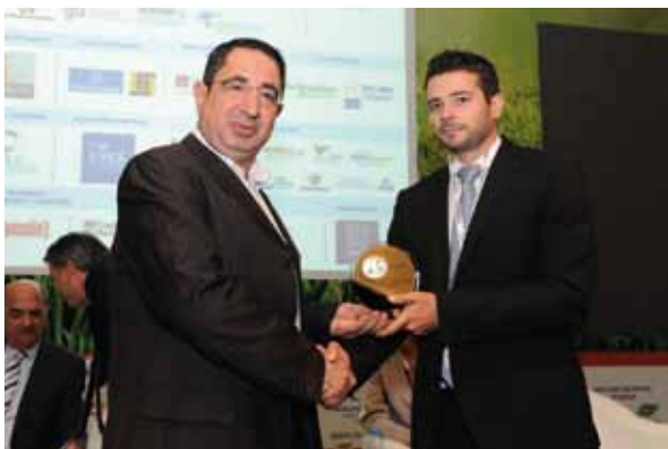
HE. MR. HUSSEIN HAJJ HASSAN MINISTER OF INDUSTRY