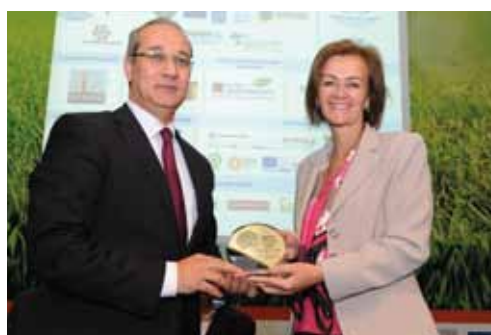
LEBANESE NGO/PUBLIC INSTITUTION/ NOT - FOR- PROFIT INSTITUTION TO: CENTRAL BANK OF LEBANON