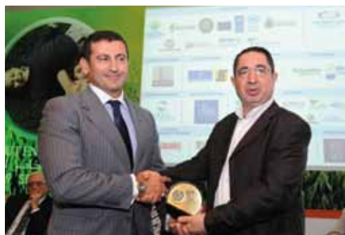
REGIONAL OR INTERNATIONAL INDIVIDUAL OR COMPANY TO: SCHNEIDER ELECTRIC