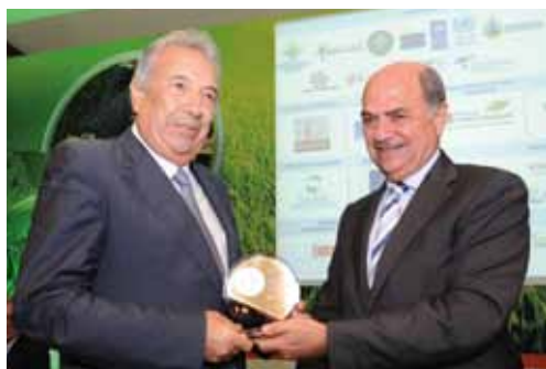
LEBANESE COMPANY TO : KHATIB & ALAMI