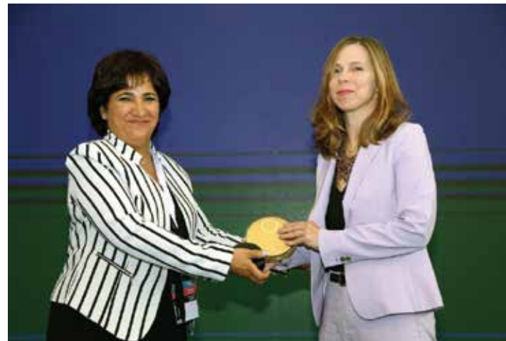
EUROPEAN BANK FOR RECONSTRUCTION & DEVELOPMENT

CATEGORY | REGIONAL OR INTERNATIONAL INDIVIDUAL OR COMPANY