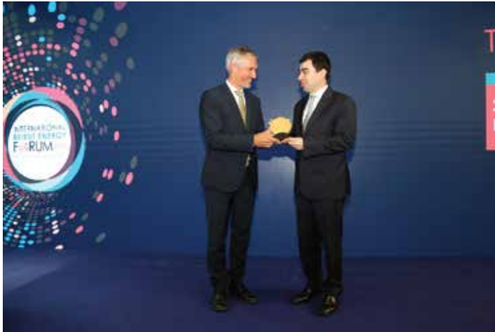
HE. MR. CESAR ABI KHALIL MINISTER OF ENERGY & WATER - LEBANON