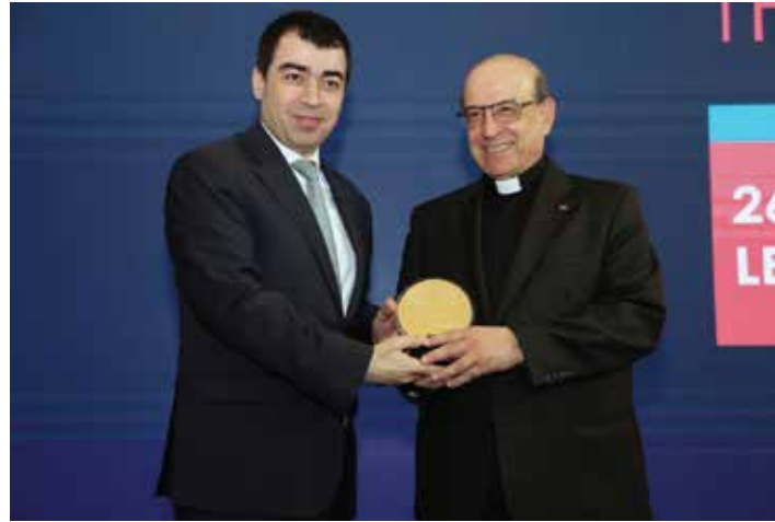
HOLY SPIRIT UNIVERSITY - KASLIK

CATEGORY | LEBANESE NGO/PUBLIC INSTITUTION/ NOT FOR PROFIT INSTITUTION